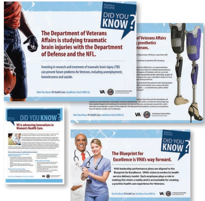
“Did You Know” campaign collateral created for VHA